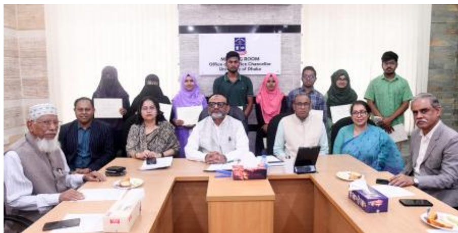
Figure 1: Students receiving scholarship

(Prof. Dr. Mokhlesur Rahman Trust • Mazeda Khatun Memorial Scholarship)