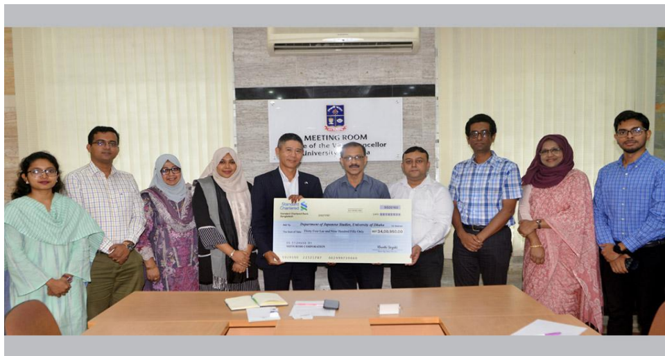
Figure 1: Mitsubishi donates Tk 34 lakh to DU for skills development, 21 October, 2024, 01:35

Full news link: https://www.newagebd.net/post/country/248278/mitsubishi-donates-tk-34-lakh-to-du-for-skills-development#:~:text=Mitsubishi%20donates%20Tk%2034%20lakh%20to%20DU,sills%20development%20*%20Mitsubishi.%20*%20Dhaka%20University.