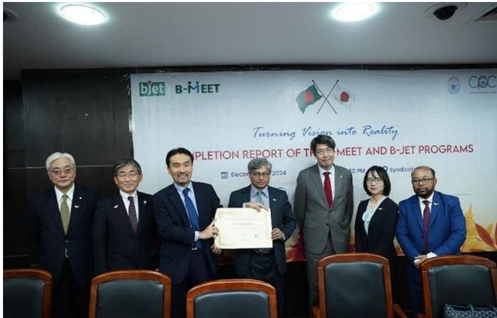
Figure 2: JICA delegation explored development and capacity-building initiatives, 18 Dec 2024, 18:29

Full news link: https://www.bssnews.net/news/231778