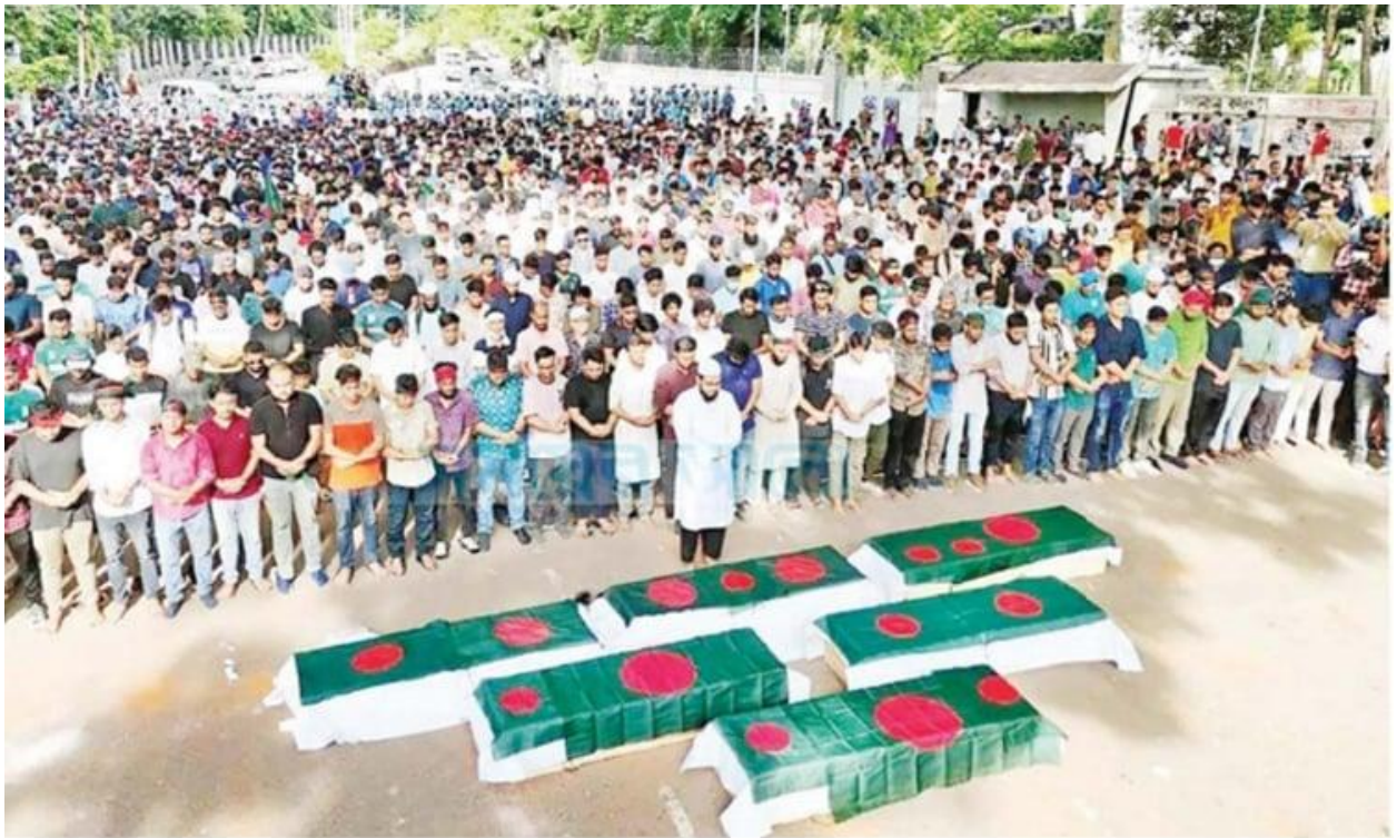
Figure 1: Quota reform protesters declared a nationwide complete shutdown on July 18, 2024, to oppose violent police and security force attacks during their demonstration and funeral procession for six killed protesters at Dhaka University campus on July 17, 2024

Focus: merit-based recruitment; equity in public-sector opportunities