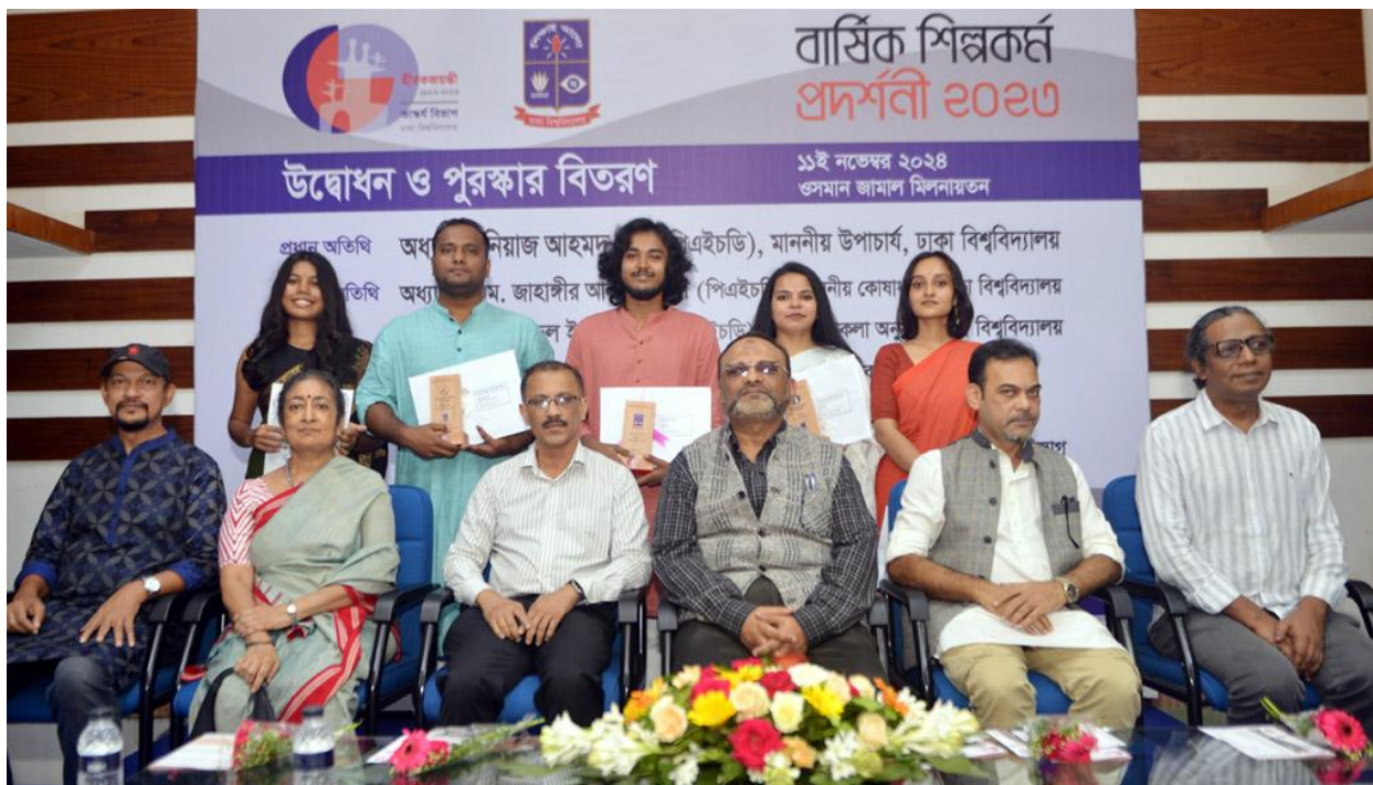
Figure 1: Annual sculpture exhibition begins at DU, 12 November, 2024, 01:26

Cultural platforms promoting democratic dialogue