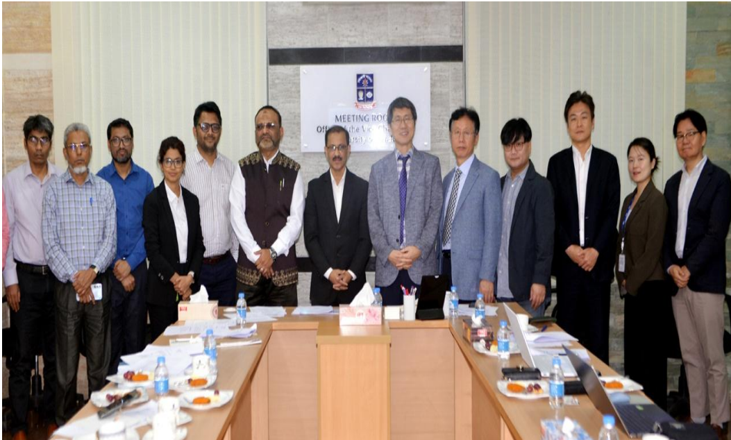
Figure 1: KOICA Country Director calls on DU VC